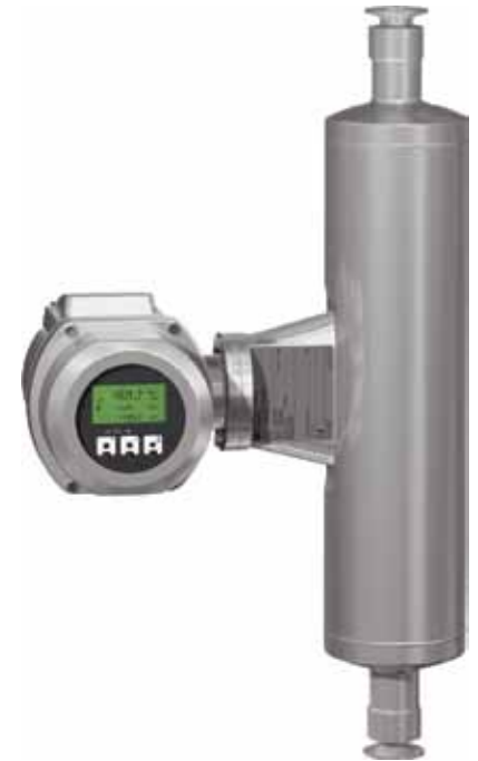
Figure 2: A Coriolis flowmeter installed in a bypass line, such as Endress+Hauser's Promass 83I, measures viscosity of the batter as it's being mixed.

One food plant installed a Coriolis flowmeter (Figure 2) in a continuous bypass line of a batter mixing tank. The batter, consisting of flour, water and additives, is mixed until the correct viscosity is reached, and then pumped to the production tank for processing. The resulting savings in ingredients and the improvement in product quality paid for the installation in less than six months.