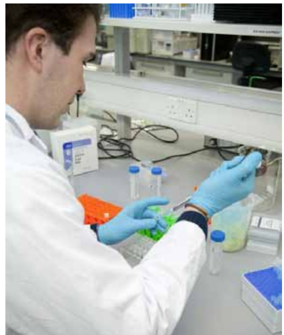
Figure 1: Taking samples from the process for analysis in the plant's lab is the tried-and-true method for ensuring quality control. It's also expensive and not a real-time measurement.

The challenge with relying on lab analyses is that it's not done in real time, it's time-consuming, it's labor intensive and it has possibility for manual errors. If it takes 30 minutes to grab a sample and analyze it, then the result represents where the process was 30 minutes ago – not now. The result could be a spoiled batch. If the measurement had been done inline, a sudden deviation would be detected, allowing for instant corrective action that could save the batch.